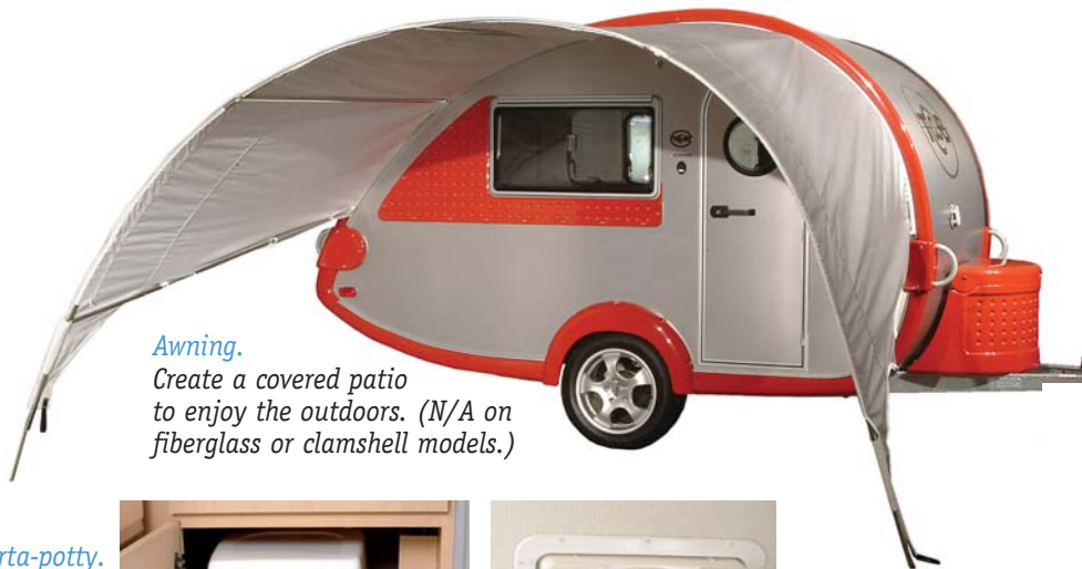
Awning. Create a covered patio to enjoy the outdoors. (N/A on fiberglass or clamshell models.)