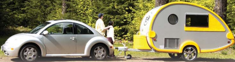
Aluminum T@B with Mellow Yellow trim (Shown with customer installed wheels)