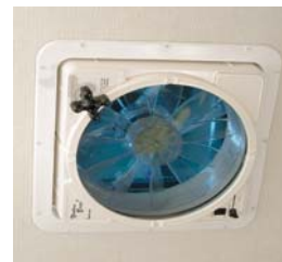
Northern Breeze™ roof vent. Power 12V fan helps recirculate the air, keeping you cool.