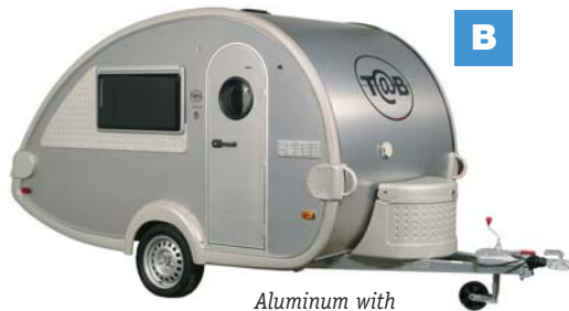
Aluminum with Jolt Grey trim