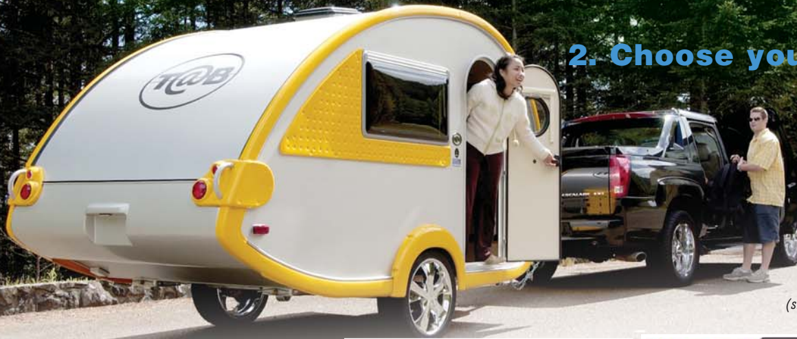
Aluminum T@B with Mellow Yellow trim (shown with customer installed wheels)