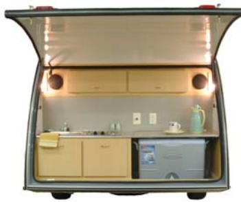
Rear kitchen with locking clam shell door.