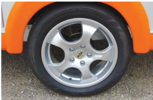
Aluminum rims with low profile tires. Replaces the standard 16" tires with steel rims. (N/A on fiberglass models.)