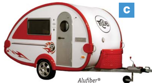
AluFiber® with Cherry trim

A Durable white fiberglass is laminated over block foam insulation and aluminum wall framing to create a stylish long-lasting finish. (Available only with Jolt Grey trim as shown.)