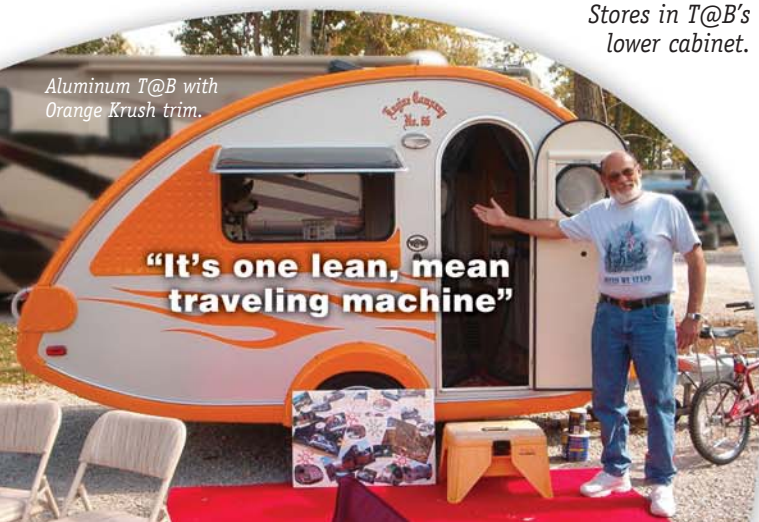
Aluminum T@B with Orange Krush trim.