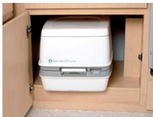
Porta-potty. Stores in T@B's lower cabinet.