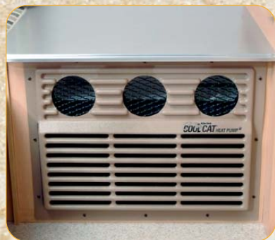
Air Conditioner with Heat Pump

Sit back and watch your favorite movies on the optional 15" flat screen TV with integrated DVD player, and a remote control is included for your convenience. You just bring the popcorn!