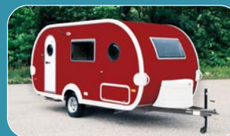
White Trim - Red Body

Recommended Trim: Mellow Yellow, Orange Krush, Jolt Grey