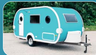
White Trim - Aqua Body