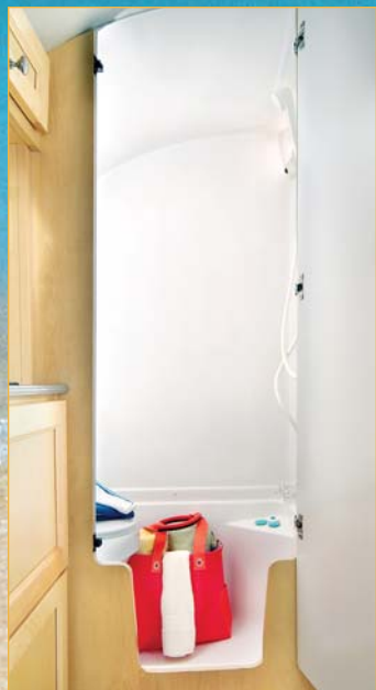
Bathroom with optional shower