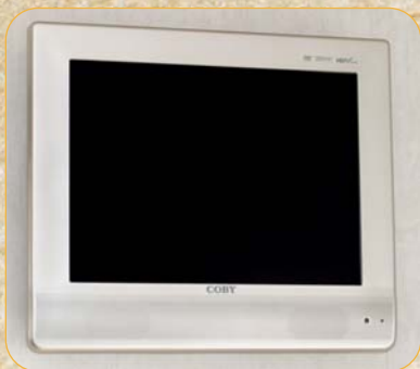
TV / DVD Combo

Sit back and watch your favorite movies on the optional 15" flat screen TV with integrated DVD player, and a remote control is included for your convenience. You just bring the popcorn!