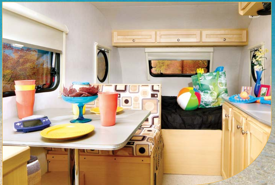
Queen bed and dinette