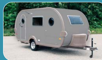
Jolt Grey Trim - Silver Body