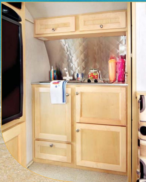
Kitchen with sink/stove combination, 12 V refrigerator & optional microwave